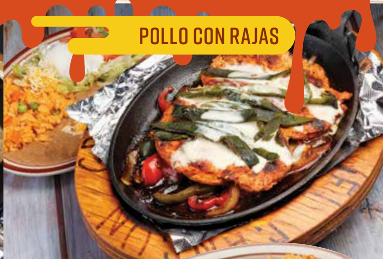
POLLO CON RAJAS