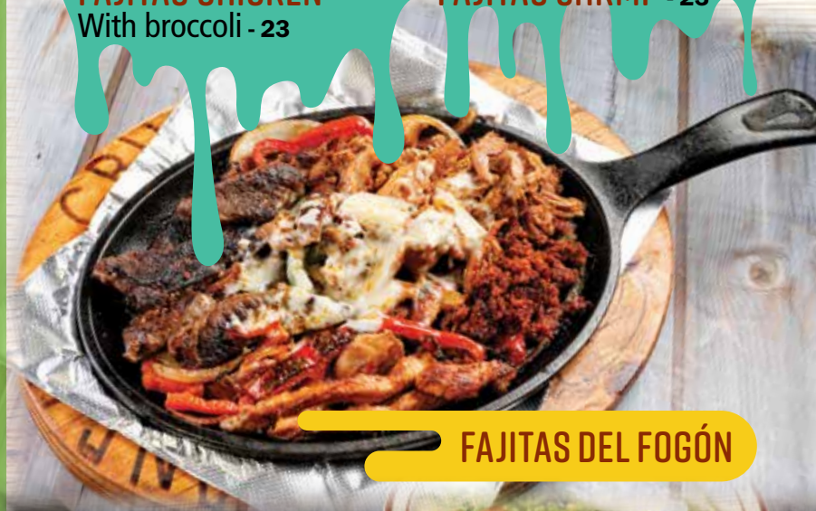
FAJITAS DEL FOGÓN